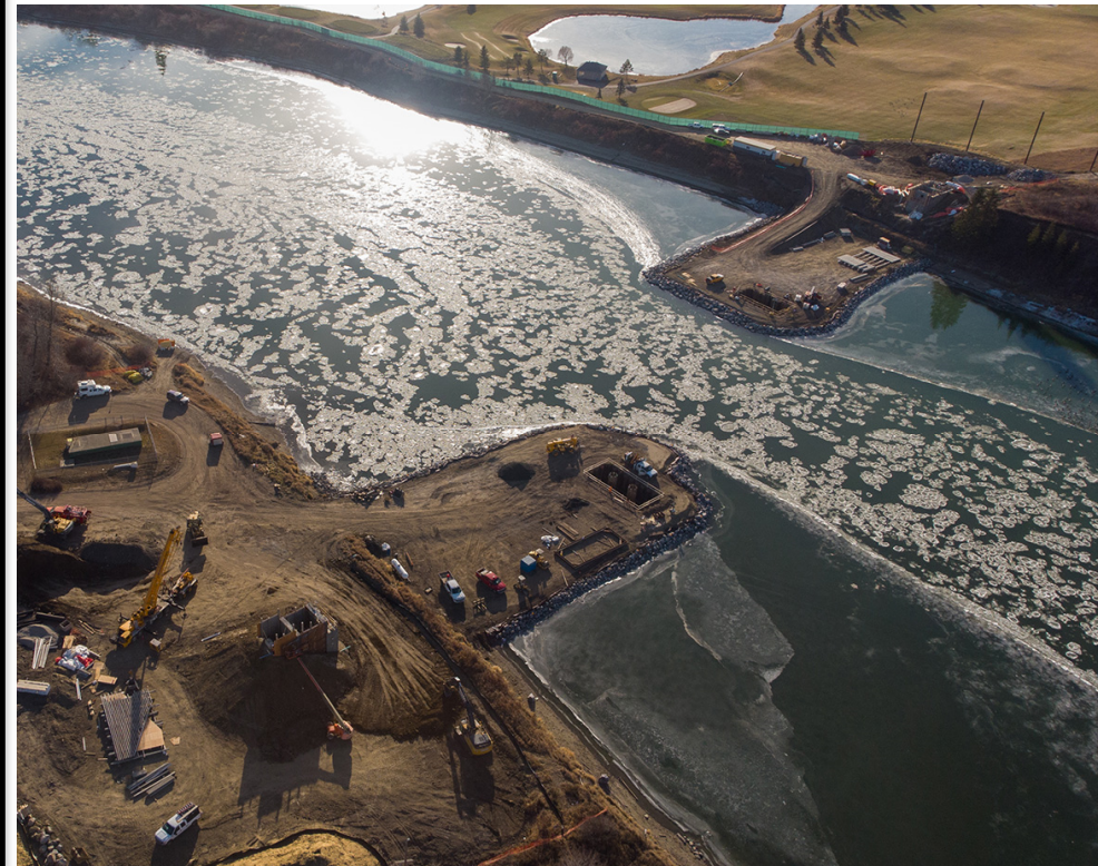
Example from City of Edmonton project

August 2025 – July 2026 North 1/3 of river to remain open