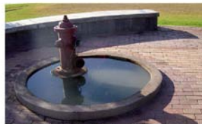
Refillable Water Station

Due to the sites proximity to Piper Creek, the configuration of the parks trail system and various amenities have been designed to emulate the meandering nature of a serpentine stream system. This organic & diverse network of pathways & trails will provide a large variety of potential uses & encourage visitors to stay on designated routes while maximizing exposure to entire park area.