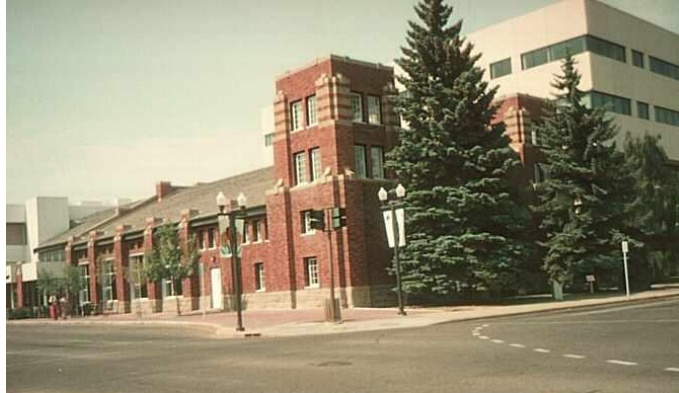
Figure 1: Red Deer Library, Former Armoury and Fire Hall, 1998