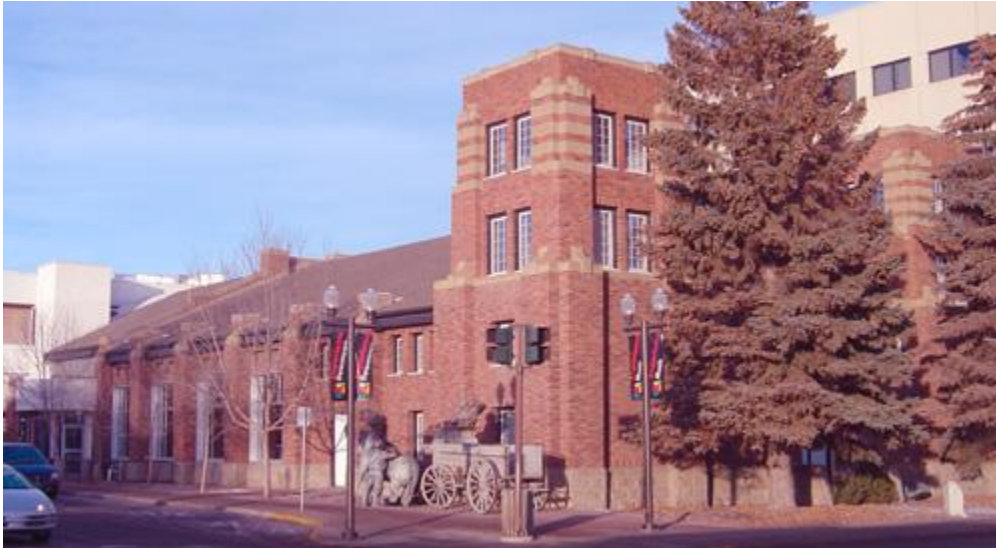
Figure 2: Contemporary Photo, Red Deer Armoury