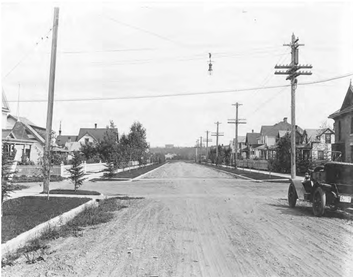
Houses on 4 th Street North (54 th Street), 1912