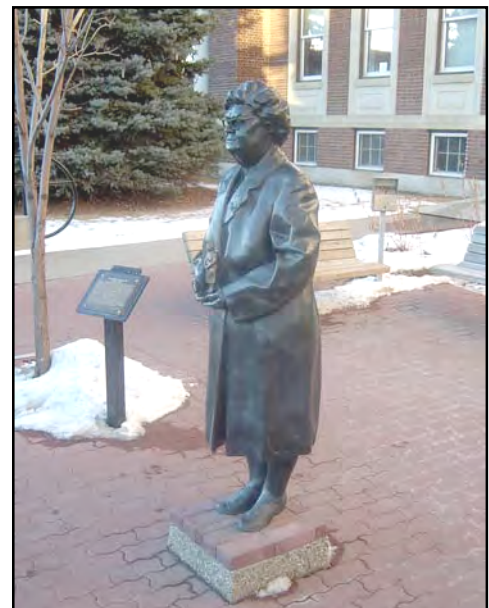
Hazel Braithwaite Ghost, Bishop's Park, Ross Street

The Heritage Preservation Committee is dedicated to the identification, preservation and maintenance of human and natural heritage features in and around Red Deer. This Committee makes recommendations to The City of Red Deer regarding designation, preservation and interpretation of heritage sites. It is comprised of representatives from the community and city staff who have a special interest and knowledge in the architectural and cultural heritage of their community. Currently, the Normandeau Cultural and Natural History Society, by agreement with The City of Red Deer, oversees the Heritage Preservation Committee. Funding for the administration of the Heritage Preservation Committee is provided by The City to the Normandeau Society on an annual basis. See Appendix F for further details.