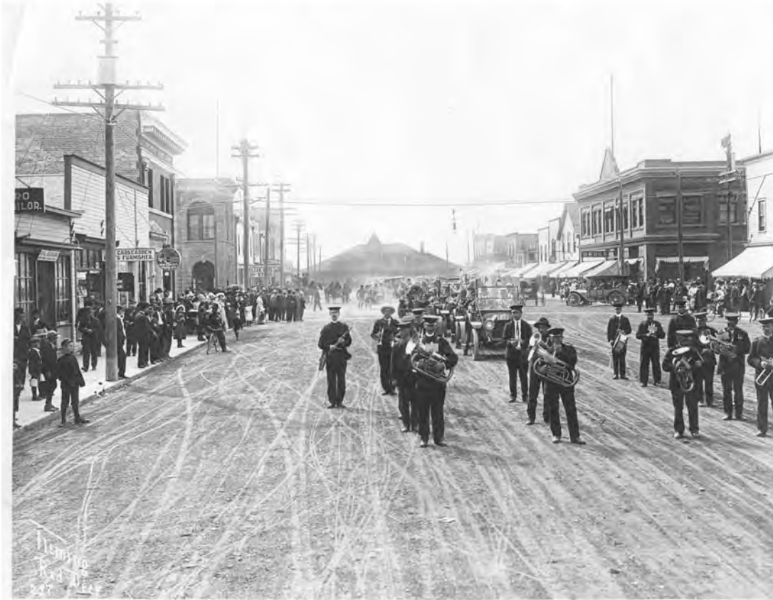
Automobile Club Parade on Ross Street, May 1912

Heritage in Red Deer consists of many different elements, including cultures, homes, commercial buildings, farms and natural features. The special features of the city's heritage include: