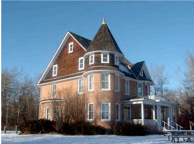
Cronquist House, Bower Ponds

In previous years, another arm's length committee of the Museum Society was formed with the mandate of organizing a public tour of historic homes in Red Deer. Tickets were sold for the event with the proceeds donated to the Heritage Preservation Committee and Red Deer and District Museum Society. There have been two tours in the past with visions of hosting a tour every two years.