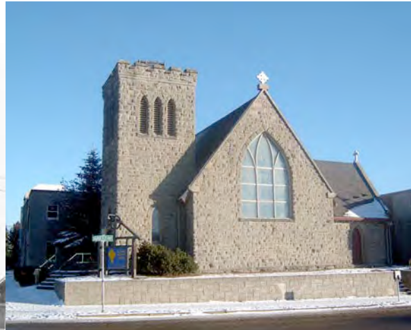
St. Luke's Anglican Church, in 1912 (Red Deer and District Archives p362-18) and in 2006