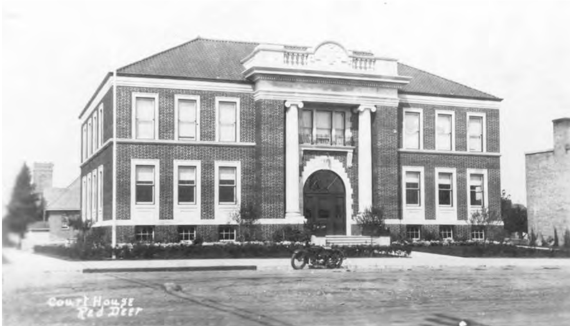
Red Deer Court House, 1932