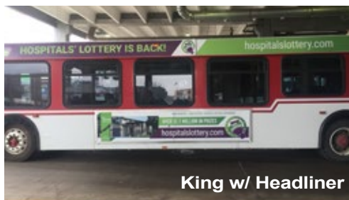
King w/ Headliner