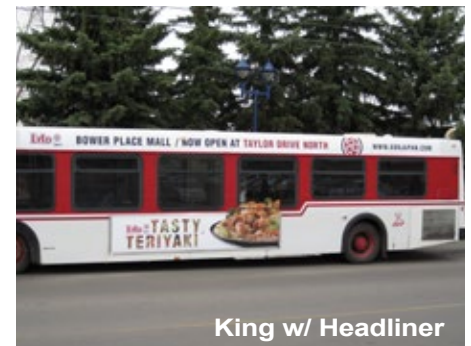
King w/ Headliner