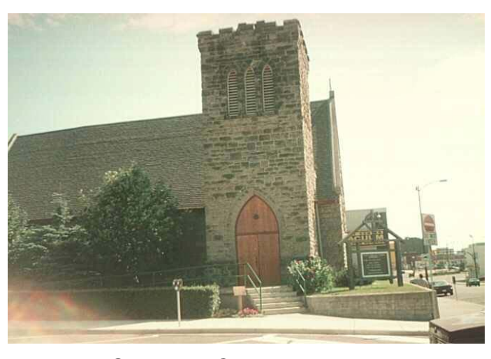
Figure 1: St. Luke's Church, 1998