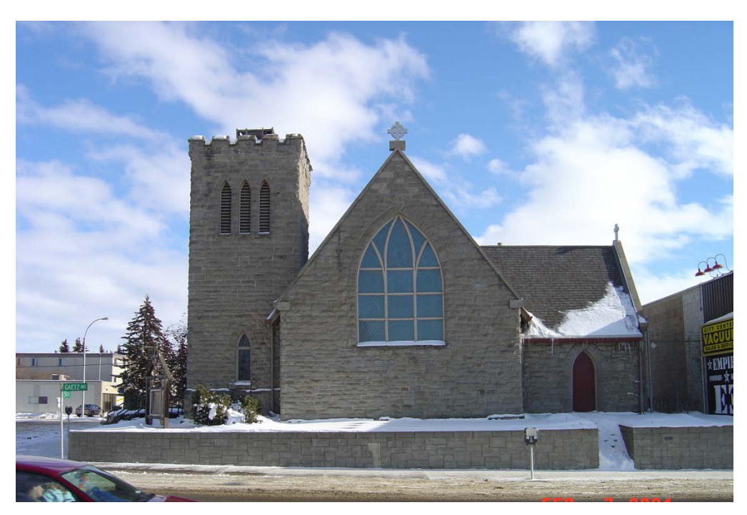
Figure 2: Contemporary Photo, St. Luke's Church